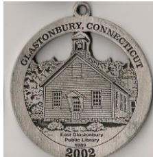
E. Glastonbury Library 2002