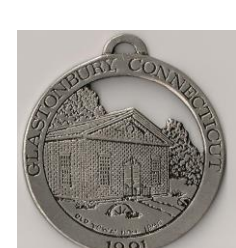
Old Town Hall 1991