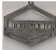
Harriman Motor Work 2005