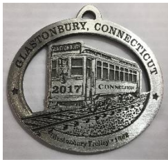
Glastonbury Trolley 2017