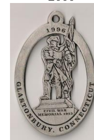
Civil War Monument 1996