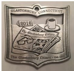
Glastonbury Citizen 2016