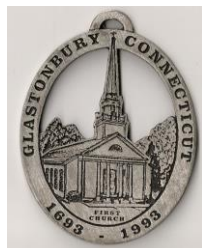
Glastonbury First Church 1993