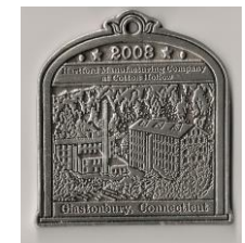
Cotton Hollow Mill 2008