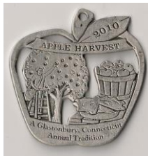
Apple Harvest 2010