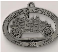
J.B. Williams Soap Factory 2004