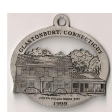
Gideon Welles House 1999