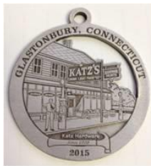
Katz Hardware Store 2015