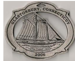
The Exact 2006