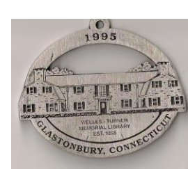
Welles-Turner Memorial Library 1995