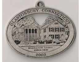
Blacksmith Tavern 2003