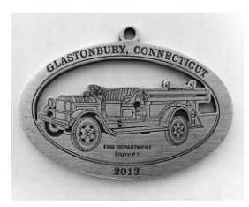
Fire Department Engine #1 2013