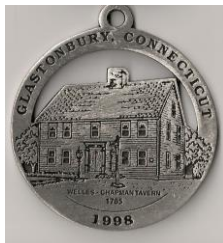
Welles-Chapman Tavern 1998