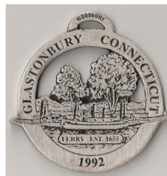
Glastonbury-Rocky Hill Ferry 1992