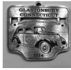
Police Department 2014