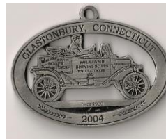
J.B. Williams Soap Factory 2004