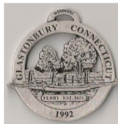
Glastonbury-Rocky Hill Ferry 1992