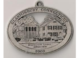
Blacksmith Tavern 2003