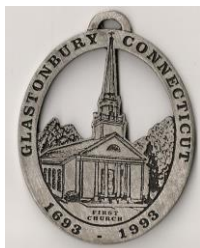
Glastonbury First Church 1993