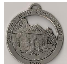
Old Town Hall 1991