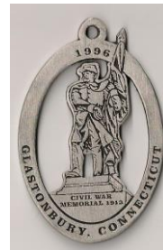
Civil War Monument 1996