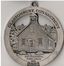
E. Glastonbury Library 2002