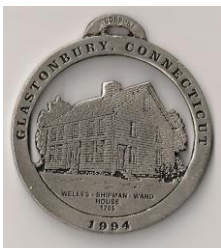
Welles-Shipman House 1994