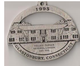
Welles-Turner Memorial Library 1995