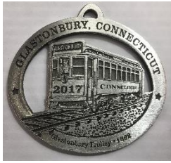
Glastonbury Trolley 2017