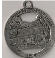
Old Cider Mill 2000