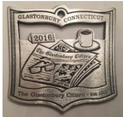
Glastonbury Citizen 2016