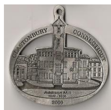
Addison Mill 2009