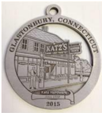
Katz Hardware Store 2015