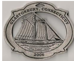
The Exact 2006