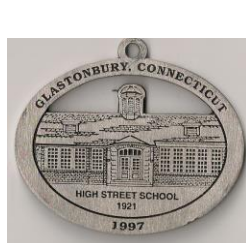
High Street School 1997