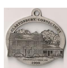
Gideon Welles House 1999