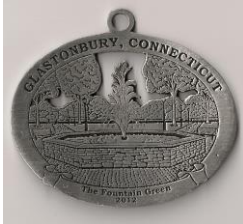
Fountain Green 2012