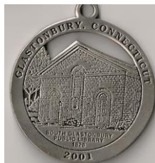
S. Glastonbury Library 2001