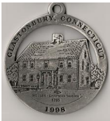
Welles-Chapman Tavern 1998