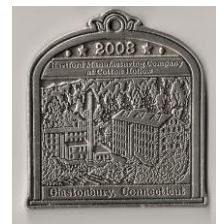
Cotton Hollow Mill 2008