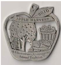
Apple Harvest 2010