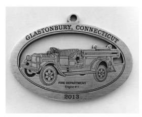
Fire Department Engine #1 2013