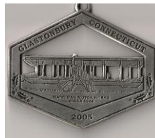
Harriman Motor Work 2005